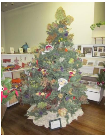
Garden Club's All-Natural Tree