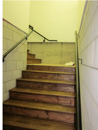
New back stairs from basement

On the second floor, the west wall has been insulated and barn siding installed.