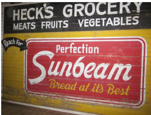
This rescued sign will be the backdrop for the grocery/general store display.

On the second floor, the west wall has been insulated and barn siding installed.