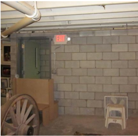
The basement opening to the new stairs

It has been a long, drawn-out process, but all the major construction has now been finished and work on the second floor exhibits has begun. The final big construction project was the state-required back stairway.